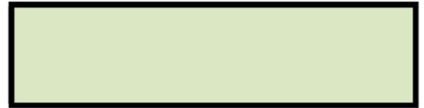
■ Bottom 1 -2 feet of the walls ■ House floor