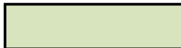
■ Bottom 1 -2 feet of the walls ■ House floor